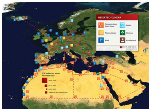
Fig. 3. DESERTEC EU-MENA Map: Sketch of possible infrastructure for a sustainable supply of power to Europe, the Middle East and North Africa. The red dashed squares represent the total surfaces needed for solar collectors plants to cover the current electricity demands for the world [46].