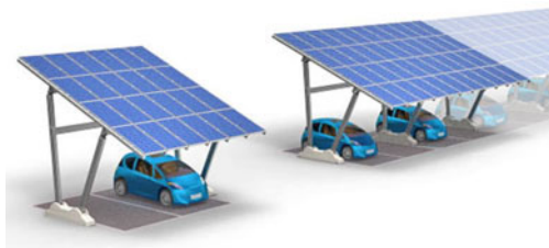
Fig. 5. Completely new user-and-energy- friendly solutions should be envisaged, put in place and transferred to the market.

move beyond heavy dependence on fossil fuel imports or to maximize export revenues from domestic oil and gas reserves, the North African states stand at a crossroads in terms of energy policy: they are interested in adopting renewable energy and/or nuclear energy, which presents opportunities for a strategic realignment of national development paths. Placed in the global sunbelt, rich in wind, geothermal and hydro power resources, the North African countries boast abundant potential for renewable energy production.