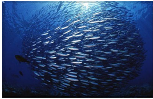
Fig. 2. Fish use vortex induced vibration generated by the fish swimming in front of them and by gliding between them to swim in the most efficient way from an energetic point of view.

power generation becomes a decentralized network of digital systems. Smart grid is a combination of electronics, information technology, management and reporting software. In this context, the implementation of new business models, which help to improve industrial efficiency and to reduce carbon dioxide emissions should be facilitated. From a retailers' perspective, the smart-grid represents both a potential opportunity for reducing fixed costs and improving customer service, and a threat of increased competition. There is an urgent need to develop computational models for different market designs, to address, e.g., how the equilibrium condition depends on market rules and what the properties of this equilibrium are. This understanding is essential since market failure due, e.g., to collusive behavior or instability of infrastructure as well as the resulting overall consumers benefit, must be correctly understood, before a particular market architecture is chosen for implementation. Developing and analyzing reliable models for competitive market architecture and taking into account grid restrictions, is also essential before any practical implementation.